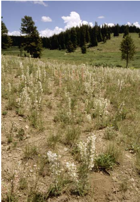
Habitat of Ipomopsis aggregata ssp. weberi