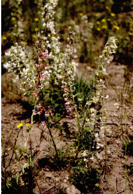
Close up of Ipomopsis aggregata ssp. weberi