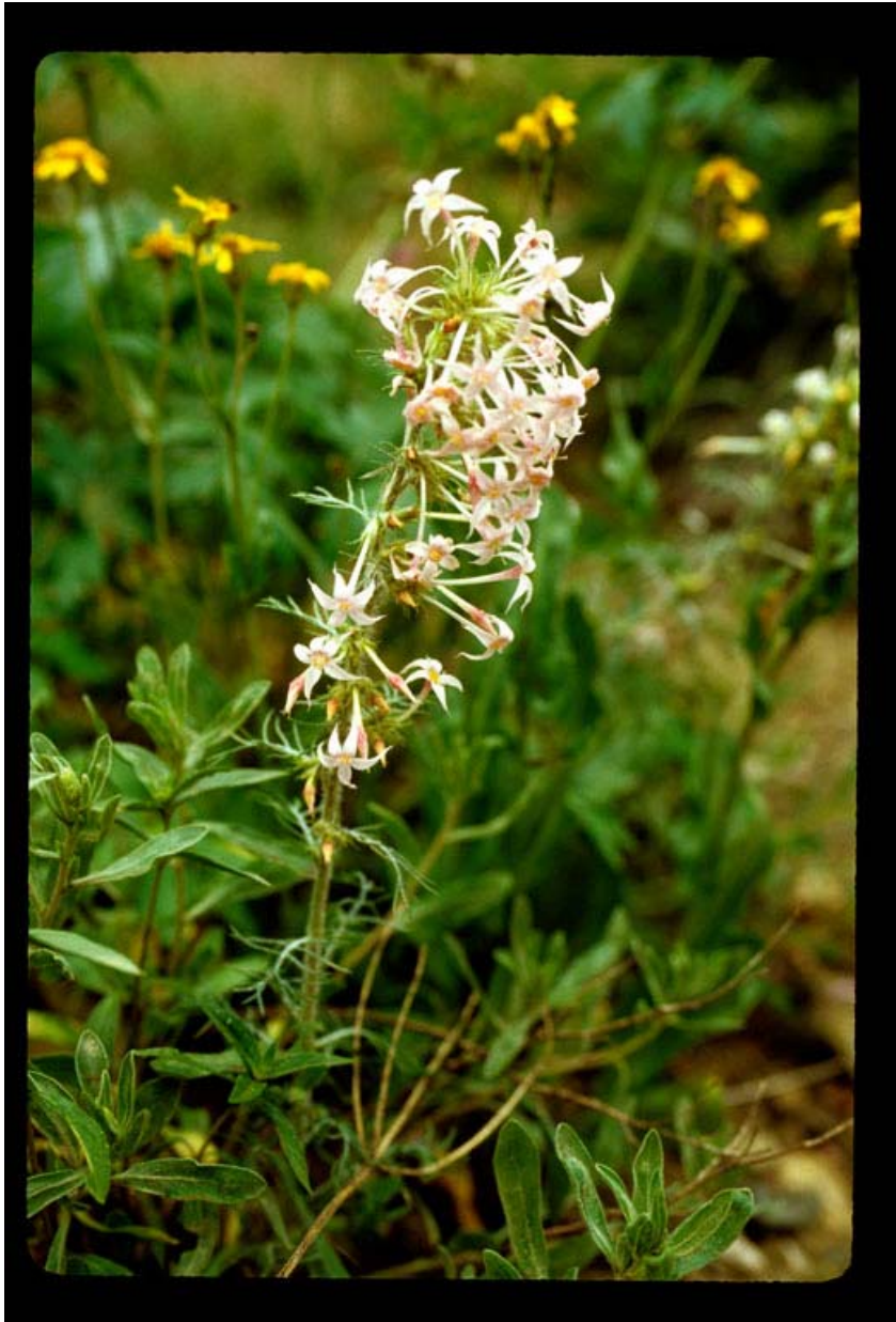
Close up of Ipomopsis aggregata ssp. weberi